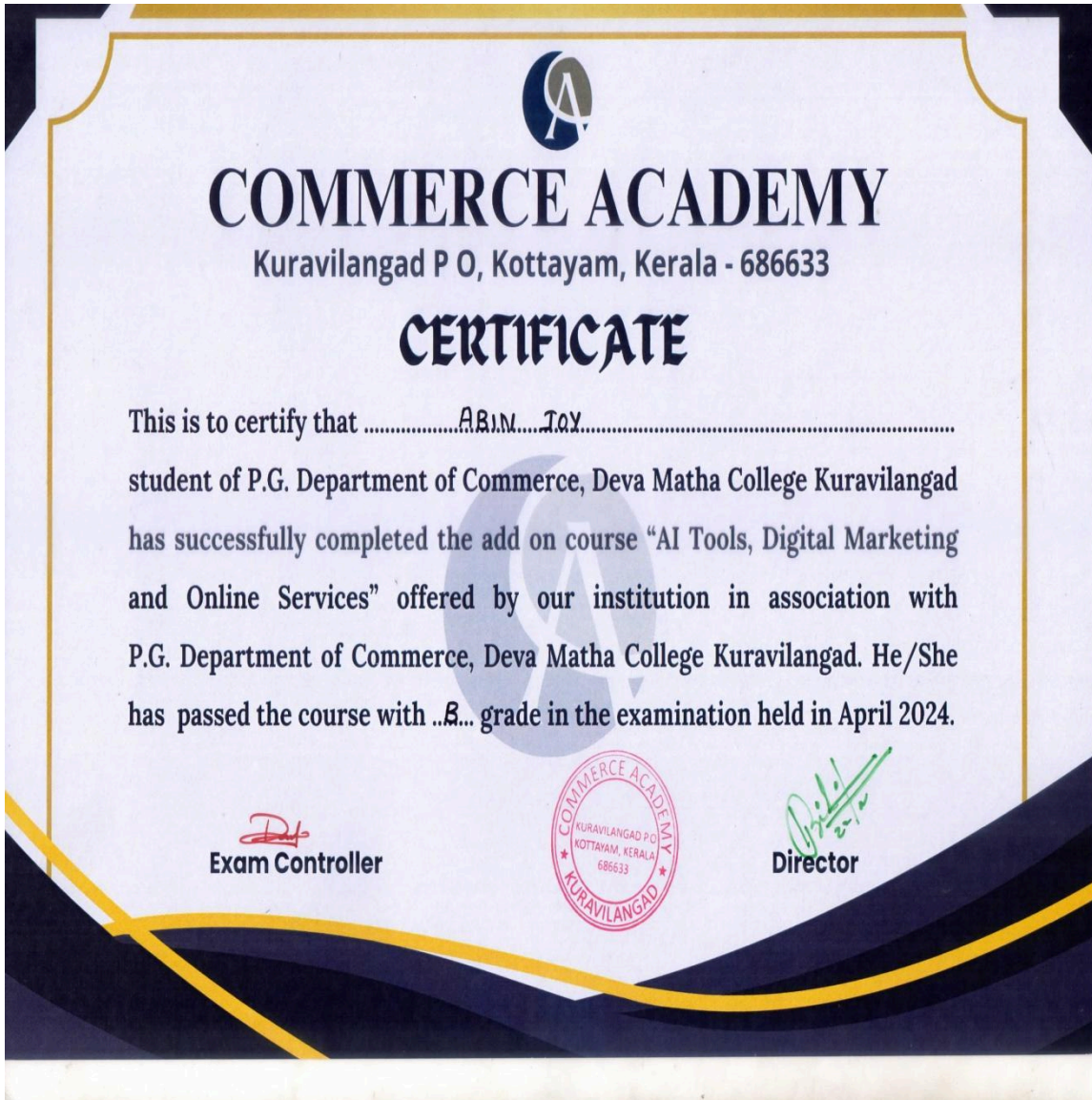
A Model Certificate