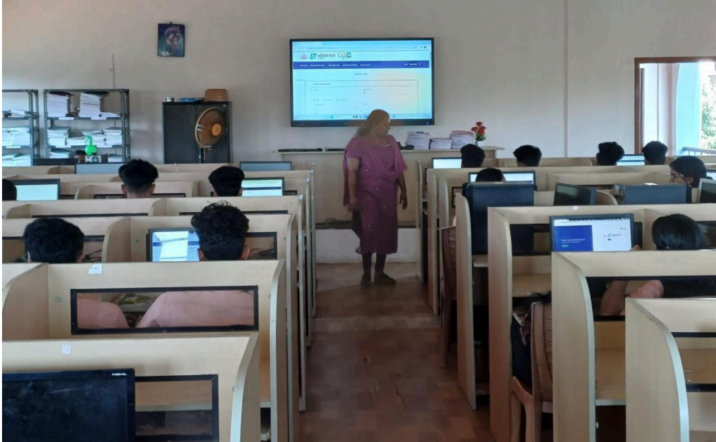
A session from online government services