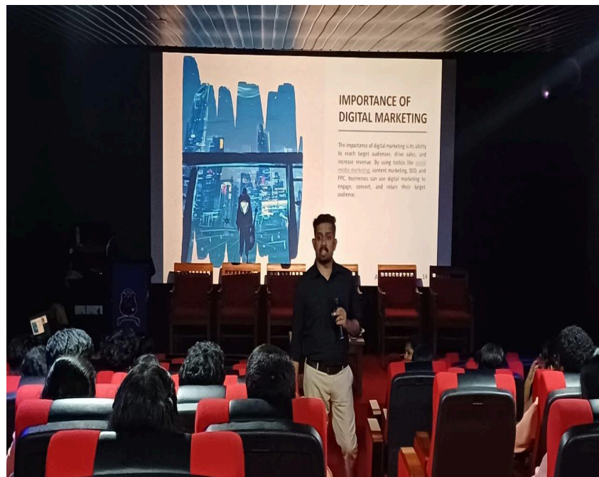
A session from digital marketing