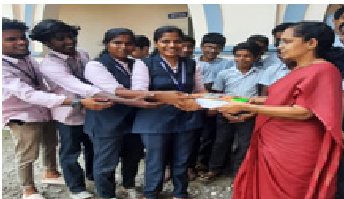
NSS volunteers distributing recycled study materials to school students