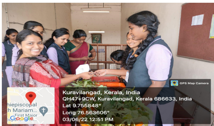
P G Department of Botany: distributing seeds and saplings of plants to the faculty and students of the College.

The Department of Botany celebrated the day by organizing various activities under the title ‘Joining the green side’. Planting tree saplings, setting up of vegetable and fruit gardens at home and short essay competitions, and poster designing competitions were conducted. The other departments also conducted various activities like ‘Plant a Tree Campaign’ by the PG Department of Commerce, a Pencil Drawing Competition by the Department of Commerce (SF) and a Poster Designing Competition by the Department of Physics.