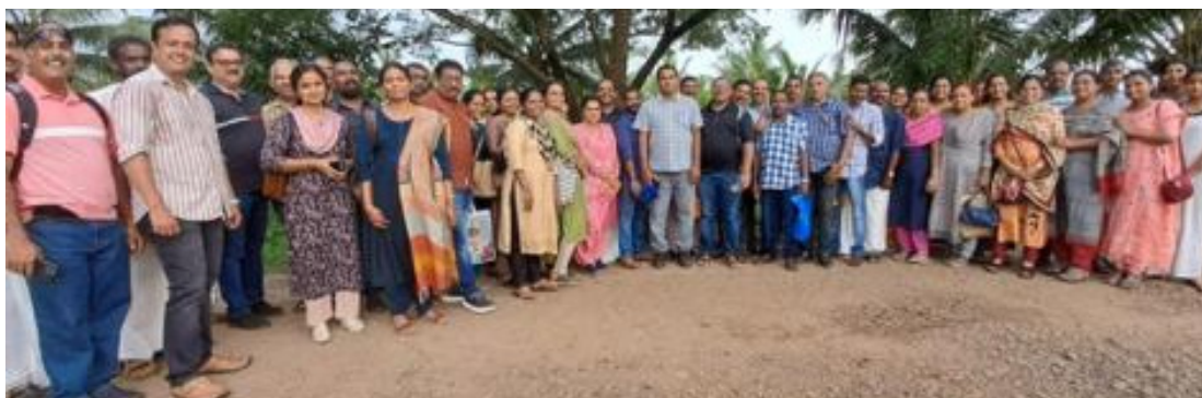
Members of the 1988-90 pre-degree science batch

A group of 250 students of the 1988-90 pre-degree science batch has formed a registered charitable trust ‘DMC HOPE 88-90 CHARITABLE TRUST’ for offering community support to the needy. They are meeting regularly and conduct socially relevant programmes like construction of houses, provision of medical aid, educational aid etc.