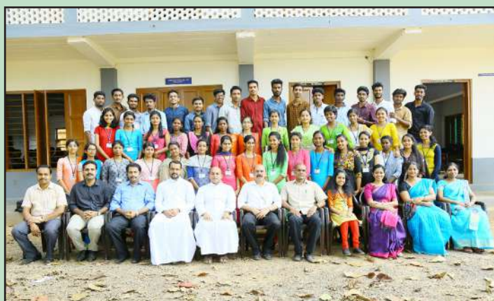
B.Com 2015 - 18 Batch